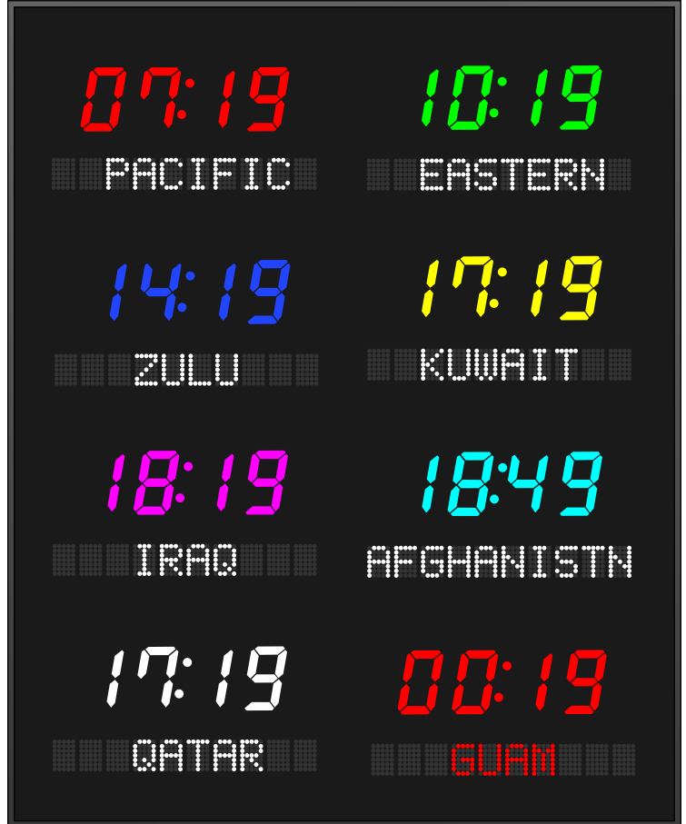
Model 6612X - 2.5" time, 1.2" zone labels, 8 zones